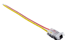
HD Power Feed (IP54) TL-4PWR-HD