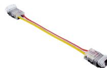
HD Linking Cable (IP54) TL-4JUMP6-HD (6") TL-4JUMP24-HD (24")