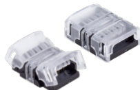
HD Splice (IP54) TL-4SPL-HD